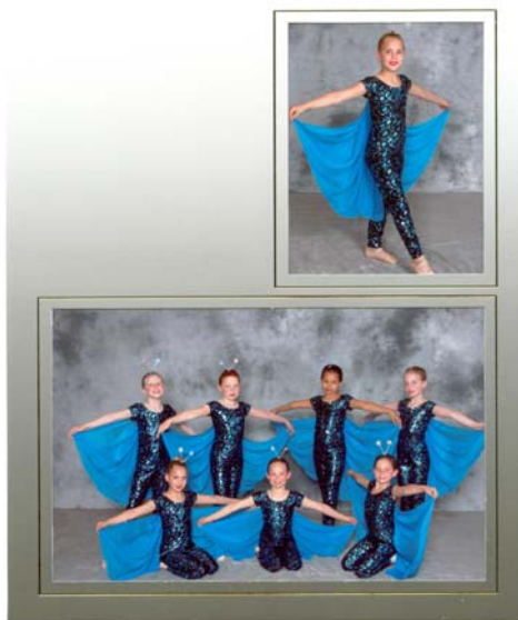
Memory Mate. (4x5 individual, 5x7 team, with folder) $8.00. Most dancers just order this